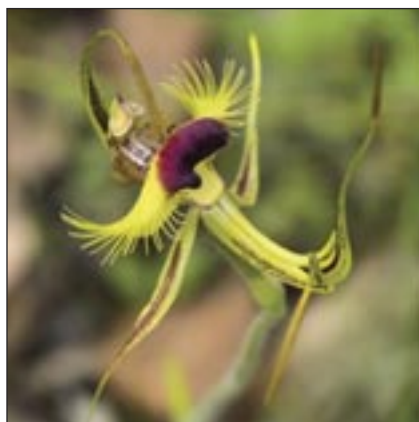
Butterfly Orchid found in South West Australia